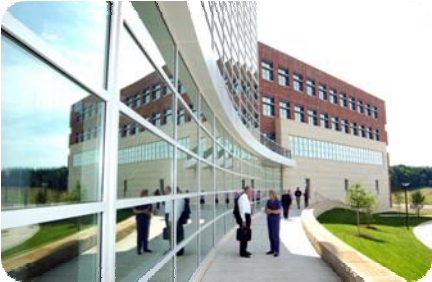
Smeal School of Business