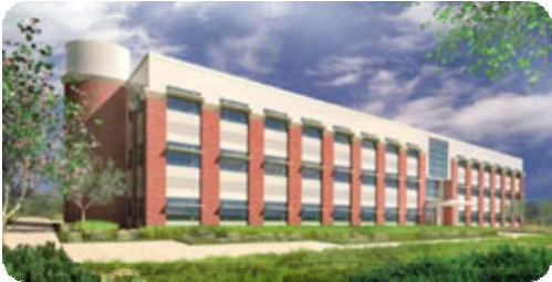
328 Innovation Boulevard