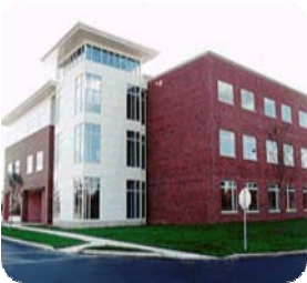
The Lupurt Building